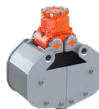
Option: bolt-on side walls

Free extension of warranty kinshofer.com/service